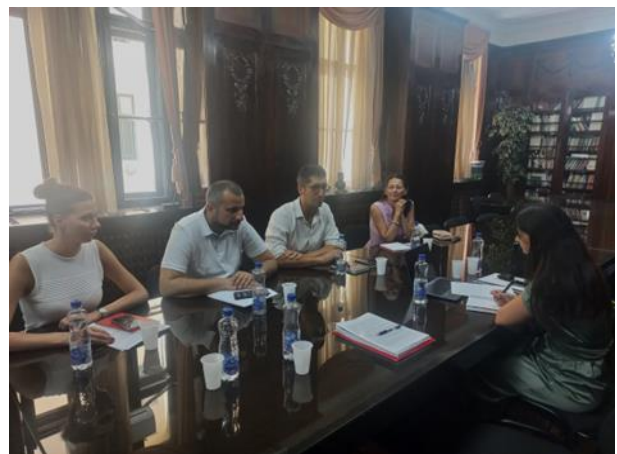
MEETINGS WITH THE RAILWAY SECTOR AND COORDINATION MEETING BETWEEN SRI AND EXPERT TEAM MEMBERS