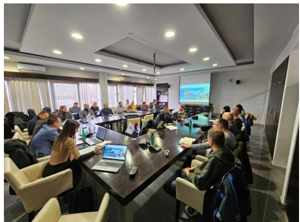
PUBLIC CONSULTATIONS IN THE AFFECTED MUNICIPALITIES (INĐIJA, SREMSKA MITROVICA)