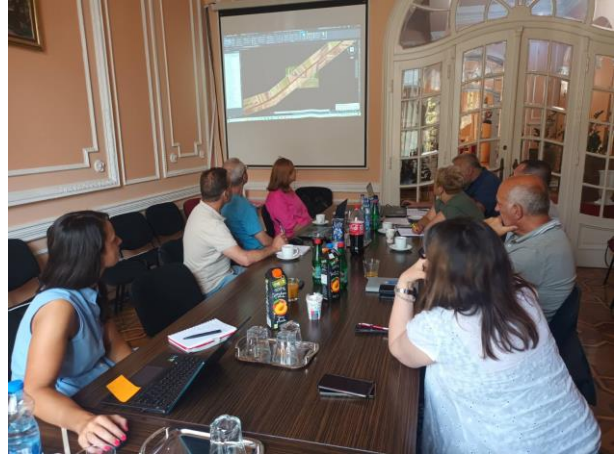
MEETINGS IN AFFECTED MUNICIPALITIES (ŠID, RUMA)