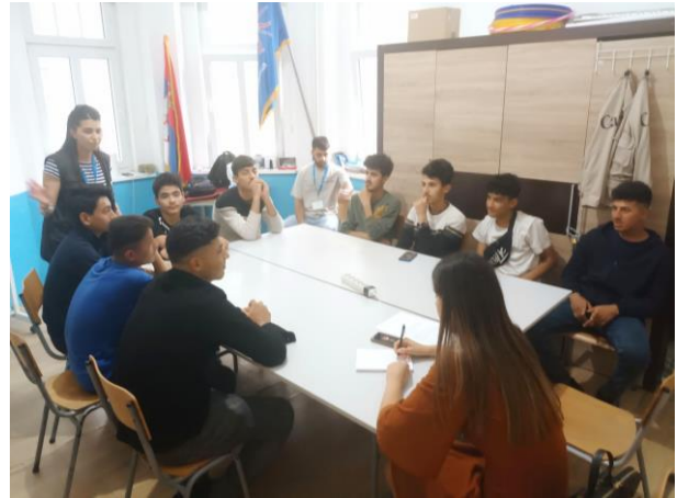
EXPERT MEETING AND FOCUS GROUP CONCERNING THE PROJECT IMPACT ON MIGRANTS