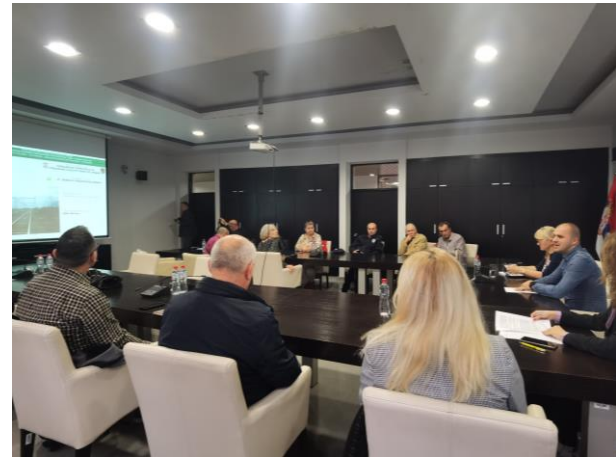
PUBLIC PRESENTATION OF THE DRAFT SPATIAL PLAN FOR THE SPECIAL PURPOSE AREA