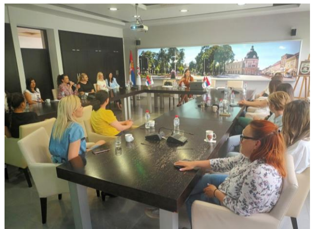
FOCUS GROUPS WITH WOMEN IN INĐIJA AND SREMSKA MITROVICA